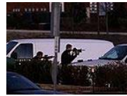
Raw Video: 911 Call From N.C. Bank Robbery