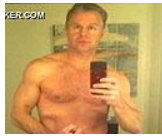
The Woman Who Brought Down a Congressman