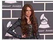
Miley Cyrus to Host SNL