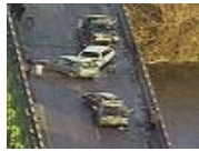
Woman Jumps off Bridge to Save Life