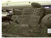
Super Bowl Sand Sculpture Honors Green Bay Packers